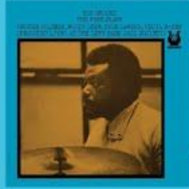
TT-M001 Roy Brooks - The Free Slave