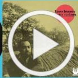
TT-M002 Kenny Barron - Sunset To Dawn